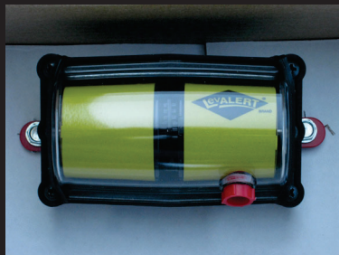
LevAlert Bin Level Indicator